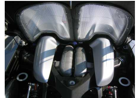
Porsche Carrera GT – no substitute !!

held at the Grandover and that evening a dinner was put on.