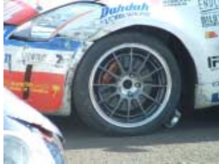
Does not look right. Upright is behind tyre!

So close to a top-ten finish. Not to be.