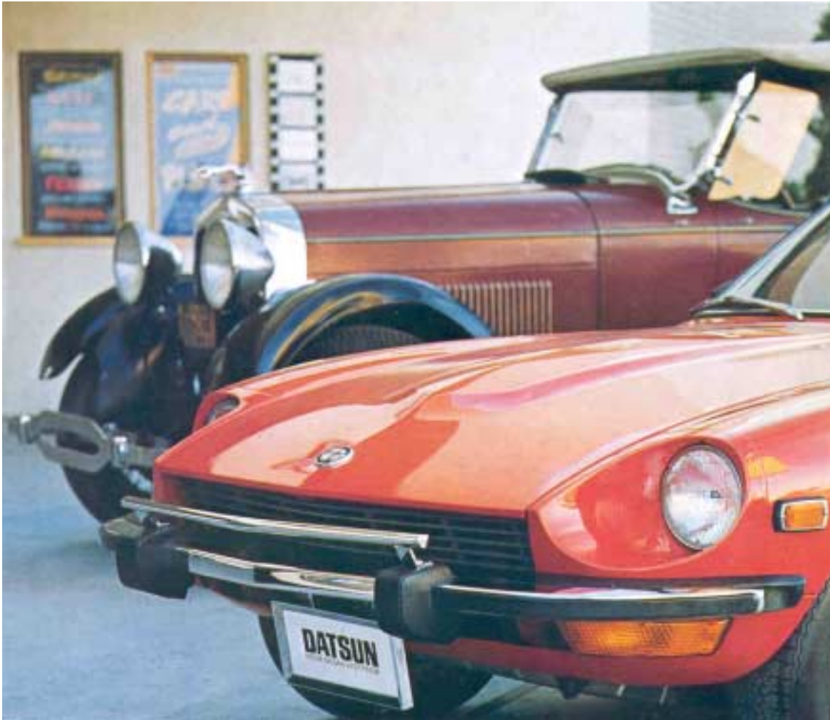
Photograph from a Datsun brochure c. 1974