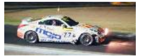
What 2 blown Pirellis do to a Z at 170 MPH

Unfortunately, after 20 minutes and 3 gained positions, a Pirelli on the right front blew out at 170mph. Limping back to the pits it was replaced with minimal damage to the RF "wing". Restarting 5 laps down in 30 th place, they went back to work and gained a few laps back before... a Pirelli on the same corner blew! This time it took a large expensive piece of right fender and wiring harness out, just before the first night shift. Quick repairs were made and, for safety reasons, the team switched to Michelins!